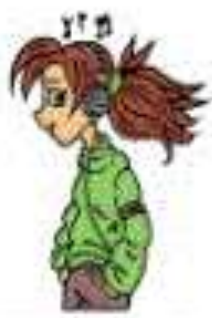
listened to music