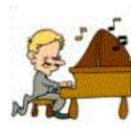
played the piano