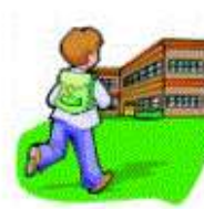
came to school