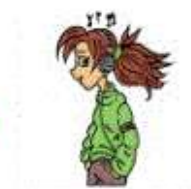
listened to music