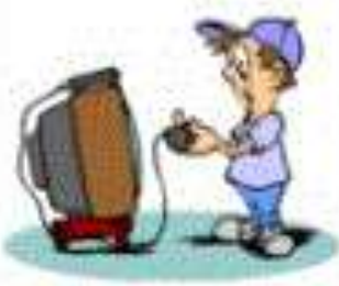
played video games