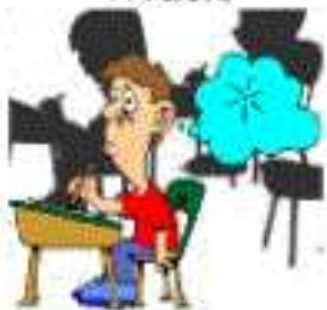
took a test