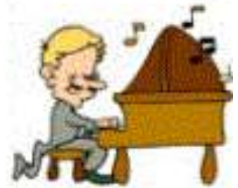
played the piano