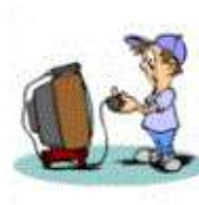
played video games