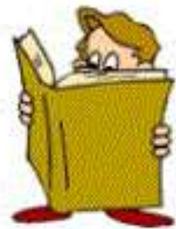
read a book