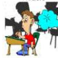
took a test