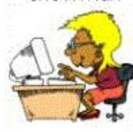
used a computer