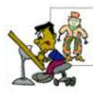
drew a picture