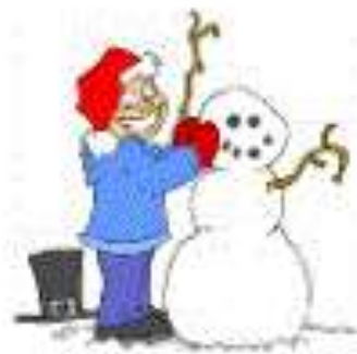
made a snowman