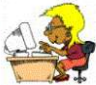
used a computer