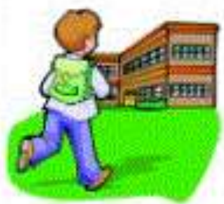
came to school