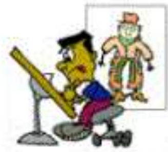
drew a picture