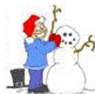
made a snowman